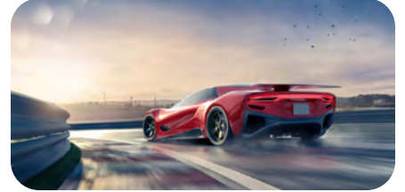
Automotive & Power