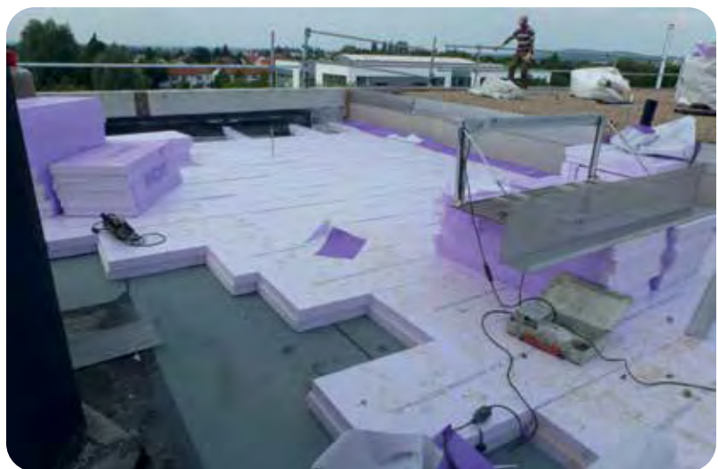
Inverted roof insulation with JACKODUR Plus for University of Applied Sciences in Lemgo

Hence the company's search for a gas blowing agent (GBA) that would help improve on Lambda levels of 34-37 mW/mK using CO 2 (JACKODUR KF) or HFC-152a (JACKODUR CFR). XPS produced using HFC-134a exhibited better thermal conductivity (29-31 mW/mK) but at a high global warming potential (GWP) of 1,300*1.