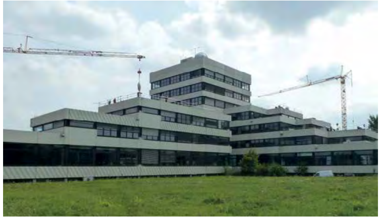
University of Applied Sciences in Lemgo

JACKON is now optimising production of JACKODUR Plus and is focused on attaining application certification in different countries. In addition an EPD (environmental product declaration) of JACKODUR Plus is in preparation – this will ensure that the material is accredited within different sustainability building systems, such as LEED and DGNB.